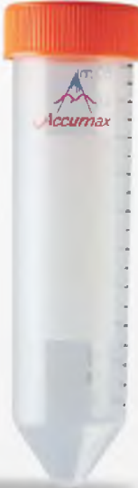
50 ML 20000 g