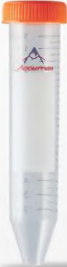
15 ML 17000 g