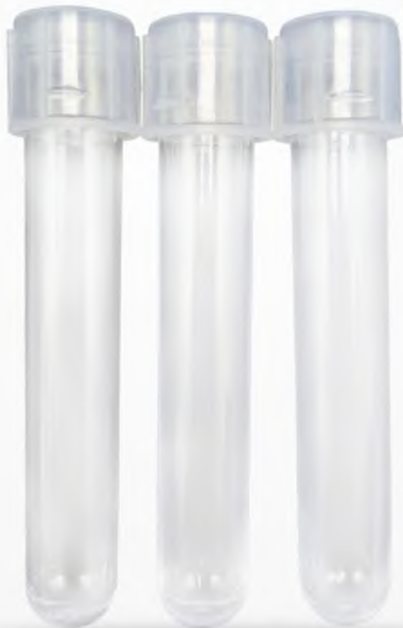
12 X 75 MM TUBES OF 5 ML CAPACITY

Made up of crystal clear polystyrene, These tubes are high quality round bottom tubes for the ease of use, reliability and versatility. These tubes are manufactured in our state-of-the-art manufacturing facility to meet rigorous quality standards. The tighter dimensional tolerances provide assurance for consistent reproducible performance in your assays.